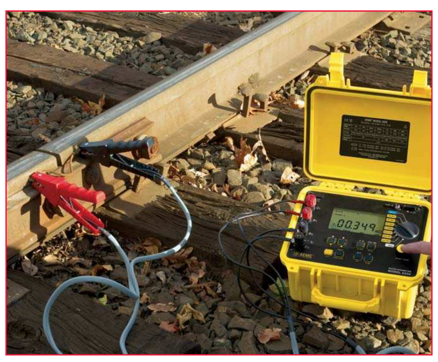
Verifying rail bonds with the Model 6250